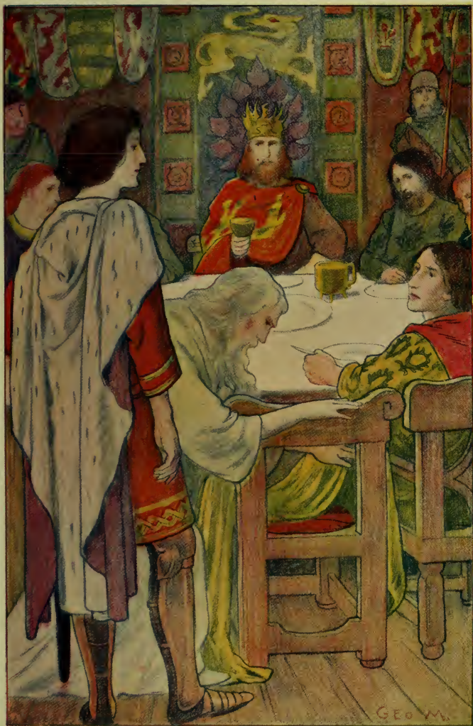
SIR GALAHAD BROUGHT TO THE PERILOUS SEAT